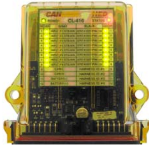
Representative Product Photo

The CL-416 is a solid-state microprocessor based module and member of the HED® CANLink® multiplexed control family. Delivered in a Deutsch enclosure, this unit provides a high density I/O count in a compact and economical package.